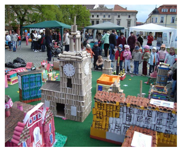
Even before paper is recycled, it may still serve as a good building material, as it was the case on the Earth Day in Uherské Hradiště.

hosted Earth Day celebrations under the motto "Human and Animals". The celebrations included a drawing competition or presentation of society for protection of predatory birds.