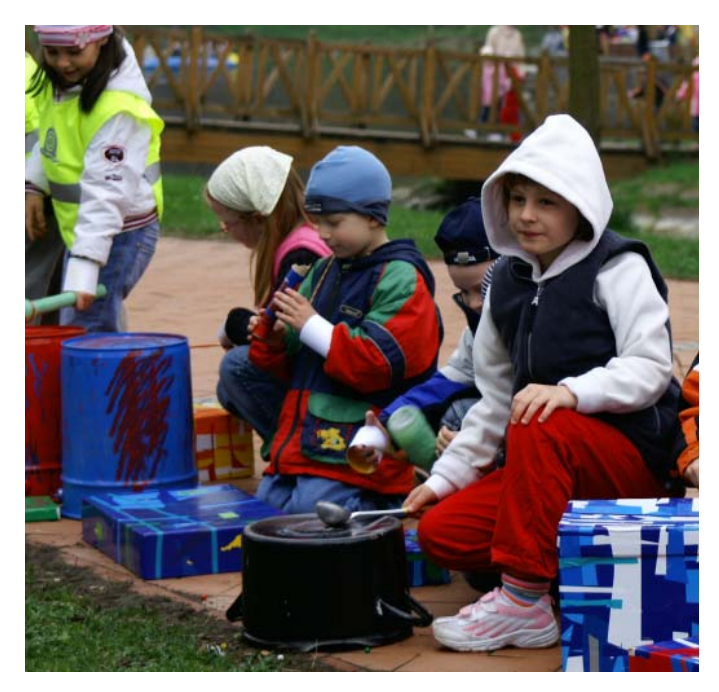
The children, who came to celebrate the Earth Day in Vsetín's Panská Zahrada, could try playing non-traditional musical instruments made of various types of waste material.

Participants of the discussion dedicated to the subject of how to recycle correctly, organised by the Family and Maternity Centre on 25th April in the Healthy City of Vsetín, received precious information on the subject. The participants' questions during discussion were answered by a worker of Vsetin's Technical Services. The answers to questions like "what happens to a waste that we sort and deliver to scrapyard" were found by the inhabitants of the Healthy City of Varnsdorf, who attended the Open Day in Eco Service Varnsdorf. Forums dedicated to the subject of waste sorting, to its influence on municipal living environment and on its economy, are taking place in May in the Healthy City of Adamov. The inhabitants' ideas and observations will be further utilised for planning and improvement in community sphere. The Healthy City of Přeštice held an open day at the local water treatment plant. Between the April 14th and 25th, there were containers for all types of waste prepared in the scrapyard for citizens as a part of municipal cleaning. Přeštice have been currently preparing implementation of bio-waste sorting system. This issue was also a subject of April discussion forum on the municipal website. The results show that 79% of voters do intend to sort bio-waste.