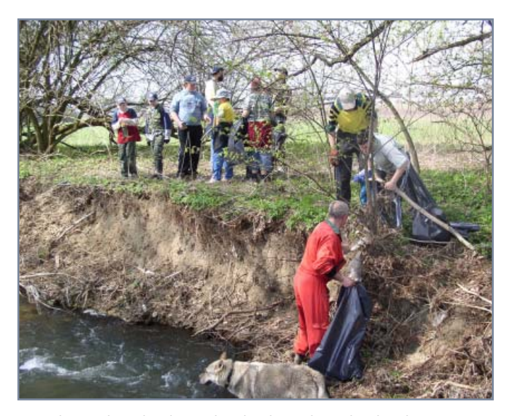
Nivnička Brook in Uherské Hradiště has been cleaned within the event "Let's Clean the World" during the Earth Day.