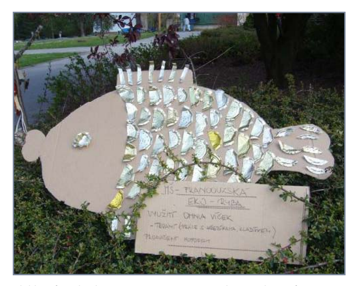
Children from kindergartens in Kopřivnice put their products of waste materials on display in front of community centre within the event "Eco-exhibition or the Sun Is Shining for Everyone".

created by children in youth clubs and kindergartens were to be seen by the local community centre. In the Healthy City of Třebíč there was already the 5th year of event titled "May the City Shine Green or Who Does Not Sort, Does Not Jump". The chance to jump in an inflatable castle was a reward for those children with parents who brought old paper for recycling. A paper city created mostly from rolls for recycling has grown during the Earth Day on Masarykovo Square in the Healthy City of Uherské Hradiště . The gain from returned paper was handed over to Rescue Station for freely living animals in Buchlovice.