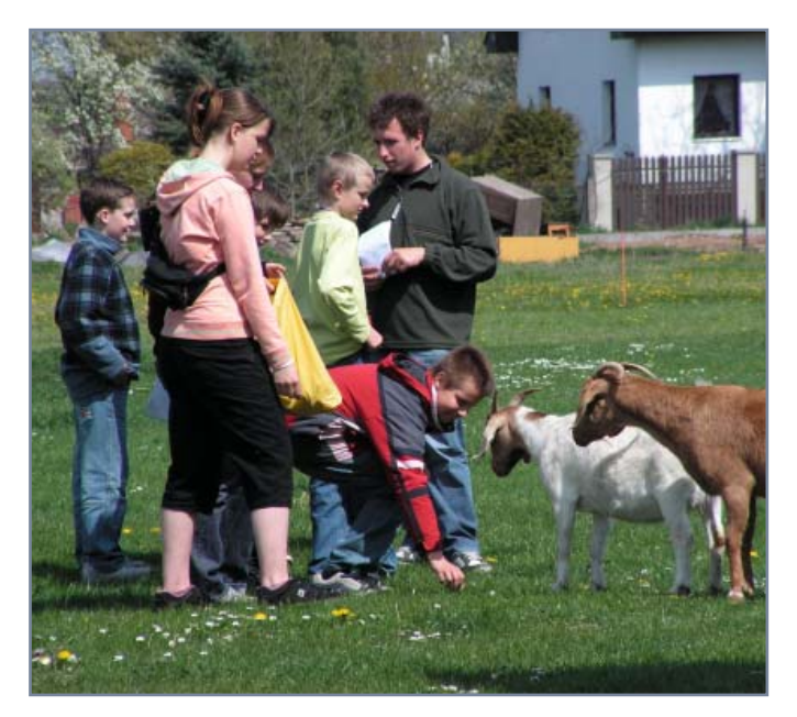
Students in the field of agricultural business at high trade school on Boučkova Street prepared a programme titled "Playfully about Farming Animals" for children of kindergartens in Poděbrady.

Exhibition of art works by school pupils on the subject of "Friendship with Earth" took place at the community centre in the Healthy City of Hlučín . Biology knowledge competition also took place at individual schools in the course of April. Within the framework of Earth Day celebrations held in the Healthy City of Valašské Meziříčí on 26th April there was an opening ceremony of new educational path situated in a precious area of Balinské Valley. Seven information boards have been installed across the path, their extension is already being planned. Educational trips made a significant part of the Earth Day programme in the Healthy City of Štětí . There was also planned a cycling trip to Kokořínsko natural preserve, a visit to Dolní Poohří natural park or a visit to Regional Museum in Mělník, connected with making of work sheets on the subjects of environmental protection in Kokořínsko natural preserve, on landscape changes and on human's influence on the environment.