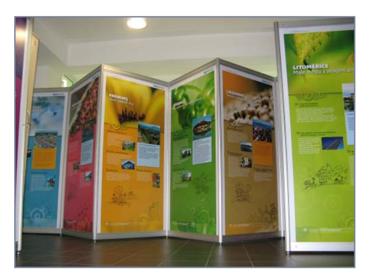
Travelling exhibition on utilisation of energy in European cities was to be seen in Kuřim.

Events related to saving energy in regular operation of domestic houses and whole municipalities took place in connection with Earth Day celebration across the whole Czech Republic. Within the framework of Earth Day celebrations held on 22nd April in the Healthy City of Chrudim on Ressel Square, the results of children's art competition for children of kindergartens and basic schools were announced. The subject was "Saving the Earth, Saving Energy, Using Renewable Resources". Consultancy services in the area of energy saving presented by company Ekowatt, including information on energy-saving measures in residential and family houses along with those on principles of low-energy houses construction were also a part of the Earth Day programme. On 29th April, the local Eco-info-centre of the Healthy City of Jihlava organised a seminar with title "Passive Houses – Living for Today" in the Regional Office building of Vysočina Region. Actual trends in low-energy building industry were on the programme of Earth Day celebrations in the Healthy City of Mladá Boleslav, where seminar titled "Passive Houses – Houses of the Future" took place on 23rd April as a result of collaboration with Eco-centre Zvoneček Vraná nad Vltavou. Travelling exhibition IMAGINE, showing the perspectives of energy utilisation in European cities and the ways of how to prevent negative impacts of climate changes was to be seen in the Municipal Library of the Healthy City of Kuřim from 1st to 21st April.