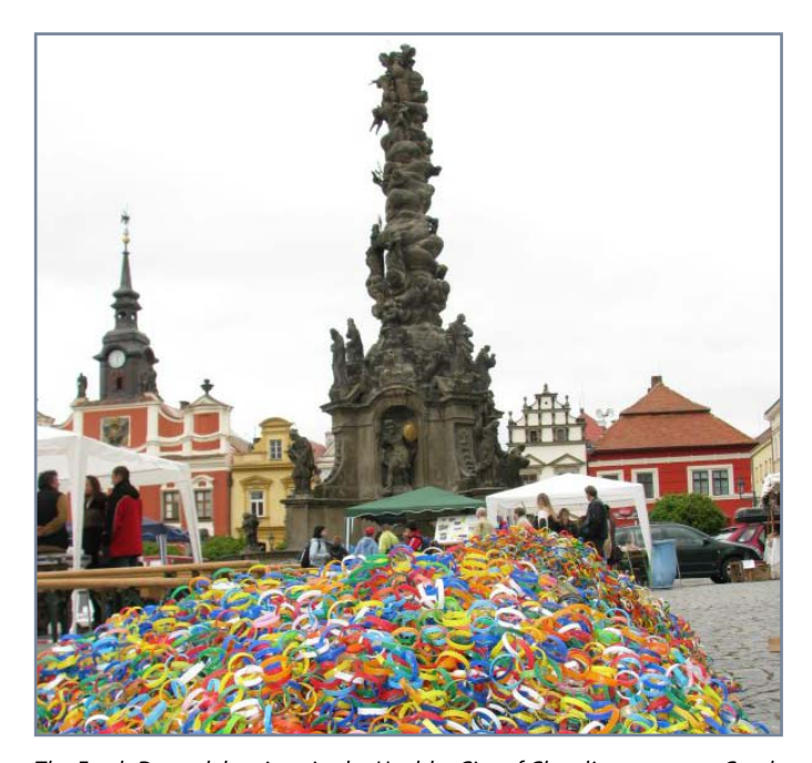
The Earth Day celebrations in the Healthy City of Chrudim set a new Czech record in a form of longest chain made of PET bottle caps, measuring 2,500 meters altogether.

It has already become a tradition that new trees are planted and public areas are cleaned along with natural locations during the Earth Day Campaign in the Healthy Cities, Municipalities and Regions. Forums dedicated to the subject of environmental protection, energy saving and recycling of waste took place again this year. For children there were prepared meetings with animals and art and scientific competitions. The campaign has been also joined by its umbrella organisation, the Healthy Region Vysočina, which supported the activities of Healthy Cities and Municipalities within its region from its subsidy programme.