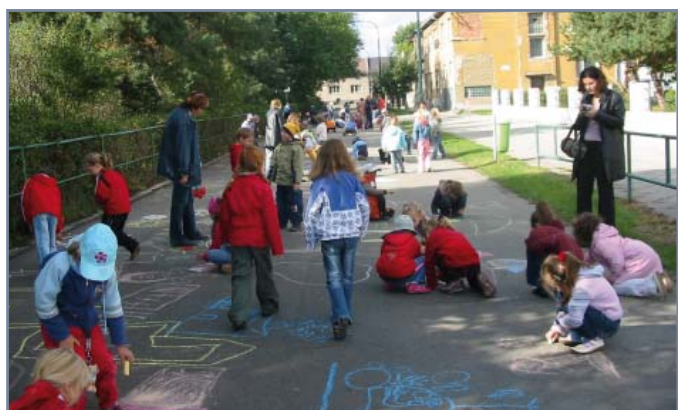
Streets of Hodonín really belonged to people. Despite being full of cars, motor-bikes and other transport means, this time there was no threat of traffic jam.

Collaboration at the regional level and common promotion enables the participating cities and municipalities to address large numbers of inhabitants, which is the main objective of EMW and CFD.