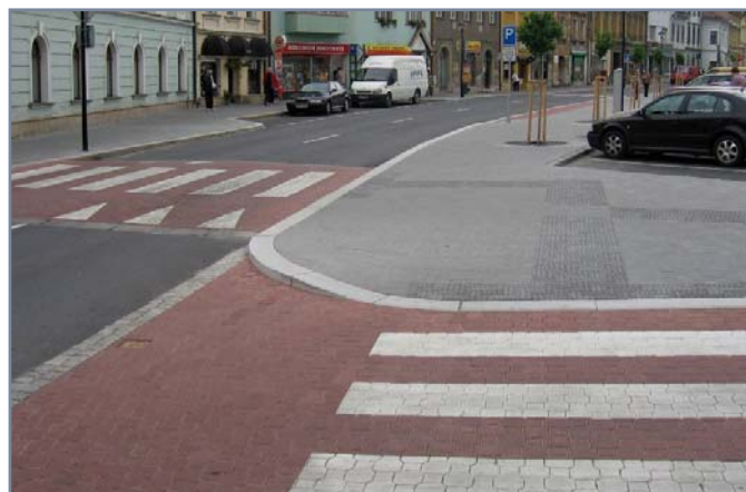
A photograph showing one of parts of award-winning project by the Healthy City of Šternberk called “City Centre Regeneration and Revitalisation” for which the city also received a financial bonus of 80 thousand CZK. The second place was taken by the Healthy City of Hodonín, the third by the Healthy City of Strakonice, the Healthy City of Poděbrady also won through to the top ten.

An overview of other present and past events can be found at the website www.udrzitelna-doprava.cz .