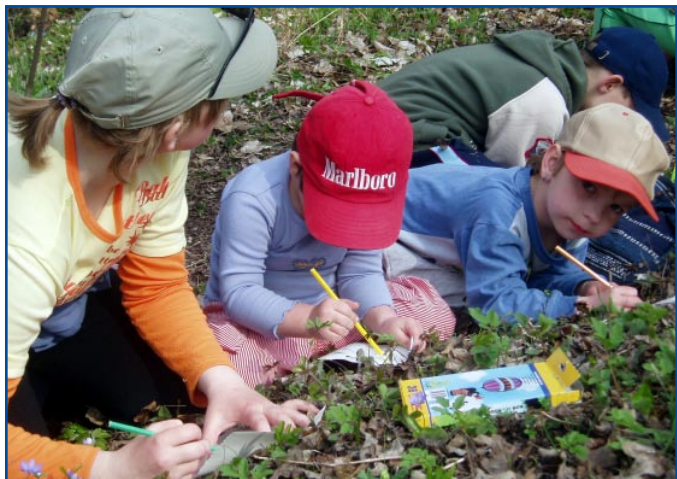
Stay in nature is for children just as important as its exploration. The Earth Day in Litoměřice was attended by more than 400 children.

City of Telč organised an Open Day and also participated in the event called Distinguishing the Birdsong in castle park. Education was the destination of trips to nature also in the Healthy Cities of Litomyšl and Třeboň . In the first mentioned city, participants went to Nedošinský Grove for an educational walk, in Třeboň there was a walk organised with telling title Way Out of Town , whose path led on the current Track of Health .