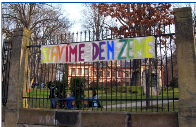
This sign "We are celebrating the Earth Day" welcomed the visitors at the Earth Day event in the Healthy City of Jilemnice.

In this special edition of HCCZ Bulletin we bring you bits and pieces of events within the Earth Day that was taking place in a number of cities from beginning of April and lasted until the end of May 2006. The complete overview of activities related to this campaign can be found at: http://www.nszm.cz/dze .