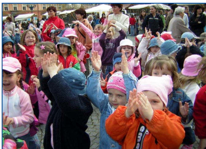
The Earth Day was a great experience, mostly for the smallest ones.

foyer of the local Morava theatre. In Mladá Boleslav they prepared a competition mini-project for basic schools and lower grammar schools, called Klenice – Clean River . The objective of this project that contained a theoretical, practical and creative section, was awaking the children's interest in their surrounding living environment. In Kopřivnice they organised on the occasion of the Earth Day an inter-school competition – Debating League , whose topic was this year "Living Environment of Kopřivnice, its Protection in Practice". The aim of this competition was verification and deepening of knowledge of young people about their living environment and possibilities of its protection. One of targets was also awakening of idea of communication between the city hall and the young generation. Fine art competitions with ecological subject matter took place also in school facilities in Třebíč . Announcement of results and presentation of the fine-art competition dedicated to waste sorting under title " Space Trips " consequently took place in the local House of Children and Youth. In the Kinských Castle in Valašské Meziříčí the House of Children and Youth organised an event called Children's Hearing, where children discussed with city representatives the questions related to protection of the living environment.