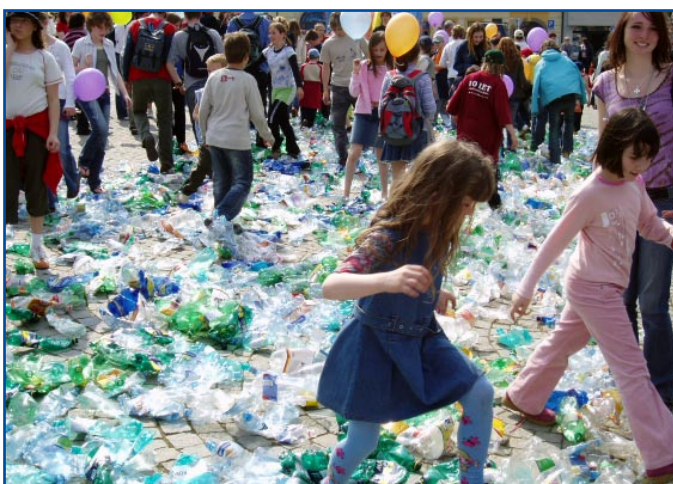
A new Czech record was set at the Karlovo Square in the Třebíč centre – the participants created a carpet including 2300 PET bottles that was consequently trampled and removed for ecological disposal.

The Šumava nature is yet again somewhat cleaner, because also in the Healthy City of Strašín municipality cleaning has taken place, accompanied by a collection of scrap and hazardous waste, assisted by the local voluntary fire brigade. The Healthy City of Letovice distributed large-volume containers over the whole city as a part of spring cleaning. The scrap collection was yet again assisted from the part of the volunteer fire brigade of Letovice. The large spring cleaning took place in the Healthy City of Křížánky . The local citizens cleaned all public areas in the municipality and presented a copybook example of waste sorting and prepared the waste for disposal, consecutively ensured along with its professional liquidation by the local municipal office. Children of the Praha-Libuš and Písnice Healthy City district proved that they can sort waste correctly even at their early age, while having fun and competing in the process. Within the Earth Day celebrations that lasted in this city district for the whole week, for instance plastic bottles were trampled for best time, waste was sorted in many stands and children produced a long snake out of waste material, the pupils of ninth grade decided to clean the school surroundings in honour of the holiday of St. George. The whole feast