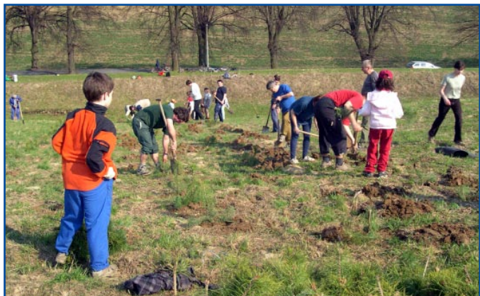
More than 5000 young tree plants have been planted in the Healthy City of Boletice as a part of the Earth Day.

the Healthy City of Vsetín there was public exhibition of photographs from Afghanistan to be seen in Vatra cinema. The photographs depict life in one of the poorest countries of the world. The author of pictures creating the exhibition called Camp Afghanistan is David Šifra of Vara organisation that actively participates in struggle against poverty. Ninth grade basic school students in the Healthy City of Kroměříž have prepared the project called Global Problems of the Present. They also dealt with serious issues of the contemporary world, searched for information in encyclopaedias, literature, in the internet and processed topics such as fight against terrorism, level of education, social inequality, living environment etc.