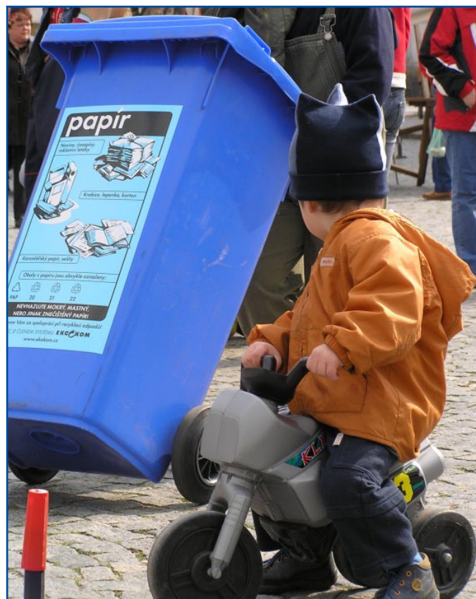
Even this little participant already knows that when his plastic tricycle wears out, it definitely would not end up in this blue dustbin.