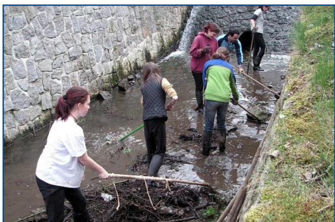
The spring cleaning also belongs among the traditional events at the opportunity of the Earth Day. A number of Healthy Cities and Municipalities organised it according to the motto Clean Up the World!

Inhabitants of Healthy Cities during the Earth Day also engaged in fully real activities related to practical protection of the environment. In the Healthy City of Mladá Boleslav there is a project being realised called Lindens for Health , as a part of which the children from Sluníčko kindergarten planted six new trees. Plant Your Tree – an event under this title has taken place in the Healthy City of Boskovice , in the course of which a symbolical tree of life has been planted in the garden of the Na dolech kindergarten. An Elm tree, which is a city symbol and a part of the city crest, was planted by the citizens of the Healthy City of Jilemnice in the local castle park on the occasion of the Earth Day celebrations. The number of visitors here also proved that the Earth Day was a success – 450 visitors this year. The old traditions were supported in the Healthy City of Moravská