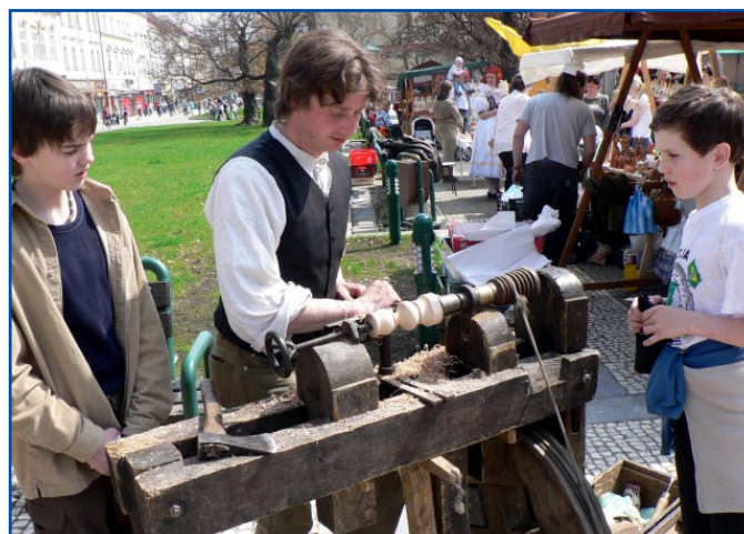
Eco-Fairs are an essential part of the Earth Day. Exhibition of old trades is also traditionally their part, it was not any different in Prostějov.

Various exhibitions and presentations of ecological agriculture products and traditional handmade products are a traditional part of the Earth Day celebrations. An Eco-Fair took place in the Healthy City of Veselí nad Moravou , where the visitors could taste e.g. bio-foodstuffs such as leavened dough bread or bio-wine. They could also