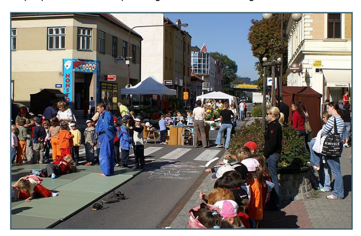
The otherwise busy Smetanova Street in Vsetín changed for the Car Free Day into a promenade where city inhabitants could refresh themselves or read a book. An eventful programme has been also prepared for the smallest ones.

Transport in its current form without exception influences lives of all inhabitants of cities, municipalities and regions of the Czech Republic. Besides undisputable advantages and improvement of life, traffic also brings serious risks related to safety of traffic participants and quality of environment. Passenger cars (PC), whose number in the Czech Republic has been growing continuously, play a significant role in both aspects. A passenger car is currently owned by 4 out of 10 Czechs. At the same time it is exactly these means of transport that participate in the amount of harmful emissions from traffic to the highest degree (7602 thousand tonnes of CO, per year) and at the same time pose a permanent threat to pedestrians and cyclists, as well as to the drivers and other passengers in cars as such. In 2004 more than 1300 people died on the roads of the Czech Republic, in the whole EU then over 43 000. Principles of safe and sustainable transport anticipate strengthening of importance of public transport and other considerate methods of transport - walking, cycling - provided that disproportional use of passenger cars would not grow.