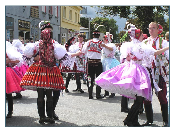
The traditional St. Lawrence's feasts in the Healthy City of Hodonín always take place on the day of St. Lawrence when the city livens up by the summer fair with traditional folk trades. There are women from other villages coming in colourful folk costumes from wide neighbourhood, accepting the invitation of the local band.