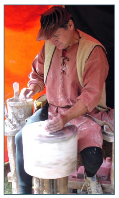
One of important functions of the country is revival of traditional trades and their preservation for next generations.

these belong e.g. provision infrastructure, of basic satisfactory level of local availability services, of quality education etc. The competitiveness of the country is facilitated investments by into modernisation and innovations as well as e.g. use of renewable resources of energy and new technical farming products that decrease dependence on the agricultural sector. The country also has an important role in protection of natural resources and the environment; it is the bearer of tradition and cultural heritage that must be preserved for generations to come. All these aspects then concurrently enhance the attractiveness and potential