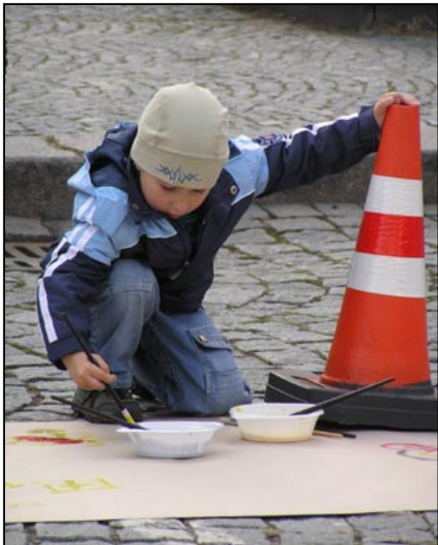
This symbolic photograph was on the title page of the Lidove noviny supplement.